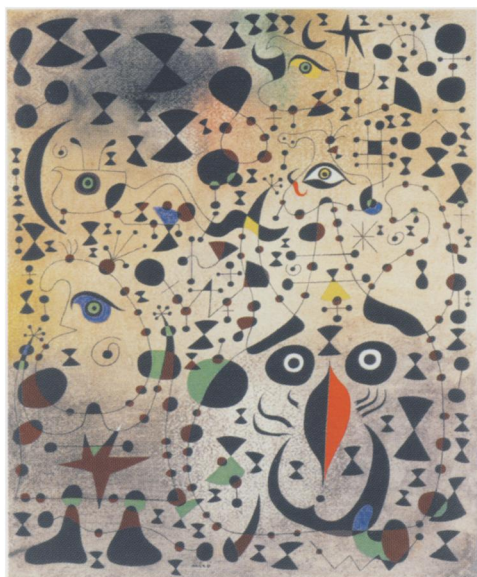
86. The beautiful bird revealing the unknown to a pair of lovers (Constellation) , by Joan Miró. 1941. Gouache and oil wash on paper, 45.7 by 38 cm. (Museum of Modern Art, New York; exh. Fondation Beyeler, Basel).

otherwise dimmed to protect the works on paper, the mobiles cast shadows that become difficult to distinguish from the solidity of the objects themselves, generating a sensation of weightless intimacy that resonates powerfully with Miró's small gouaches. Such juxtapositions can elegantly reveal the conjunction of shared thematic interests with the visual means to express them, but when such pairings are virtually the only strategy used to articulate historical, conceptual and formal relationships, the repeated effect can be numbing (particularly in a crowded installation), however high the quality of the works.