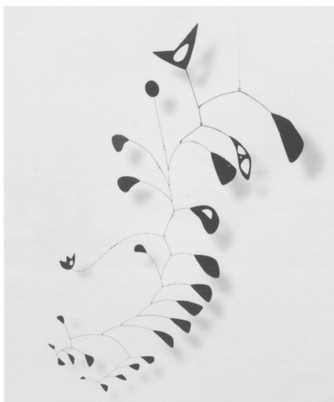
87. S-shaped vine , by Alexander Calder. 1946. Sheet metal, wire and paint, 250 by 175.5 cm. (Eli and Edythe L. Broad collection; exh. Fondation Beyeler, Basel).

This is unfortunate, especially since their explorations often took them into each other's territory, with Miró using aspects of sculpture and assemblage as a weapon against painting and Calder conceiving the play of his sculptures' elements pictorially as well as three-dimensionally. A few of Miró's more