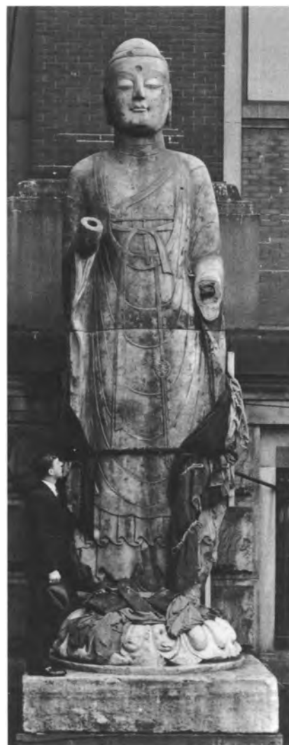
21. The Amitabha Buddha observed by an unknown man. Sui dynasty, 585 A.D. 580 by 203 cm. (British Museum, London;).