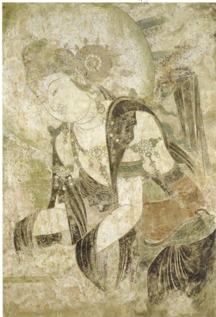
13. Wall painting fragment with Bodhisattva figure. Five Dynasties period, Later Zhou dynasty, c.952 A.D. 84.5 by 57.2 cm. (Art Institute of Chicago).

Several forces combined to make the Burlington House exhibition the largest yet held. The collectors based in London, such as Eumorfopoulos and David, as well as London-based dealers such as Loo and Yamanaka, who had already lent to the earlier shows, made common cause with museum curators and academics. With well over three thousand exhibits, the London exhibition dwarfed the 1929 Berlin show which, in its turn, had trumped the Cologne and Amsterdam exhibitions, although these earlier shows still rank among the largest exhibitions of Chinese art ever held and included a large number of objects that were later selected for the London exhibition, including those from the Eumorfopoulos collection (Fig. 14). 21