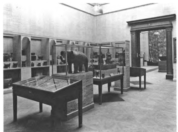
11. Ancient bronzes and jades displayed in Gallery I: Shang-Yin and Chou dynasties.

works of art surveyed in the present section, the Chinese items should this year be more numerous and important than ever before; and, yielding to a sense of fitness, it is with these that, on the present occasion, we shall commence our survey'.