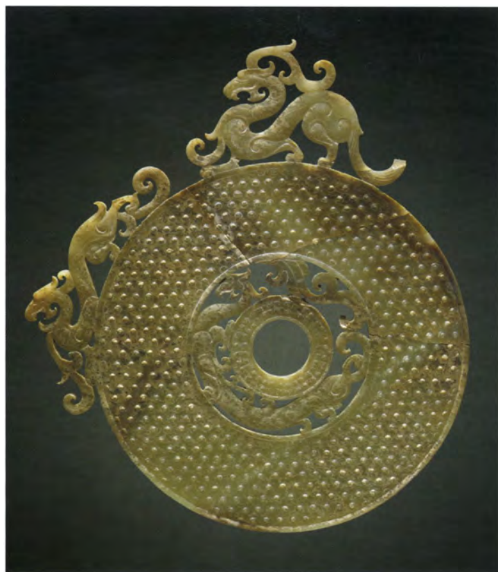
17. Bi disc with dragon motif. Eastern Zhou period, c.770–221 B.C. Jade, 16.5 cm. diam. (Nelson-Atkins Museum of Art, Kansas City).

professor of geology in China. In October 1926 he hosted a scientific and archaeological meeting just south-west of Beijing at Zhoukoudian village, attended by Andersson and Chinese and foreign archaeologists and the Crown Prince and Princess of Sweden, to discuss the material related to Peking Man ( Homo erectus pekinensis ; originally Sinanthropus pekinensis ), recently unearthed near the Longgushan Cave at Zhoukoudian, Fangshan, Beijing. 39