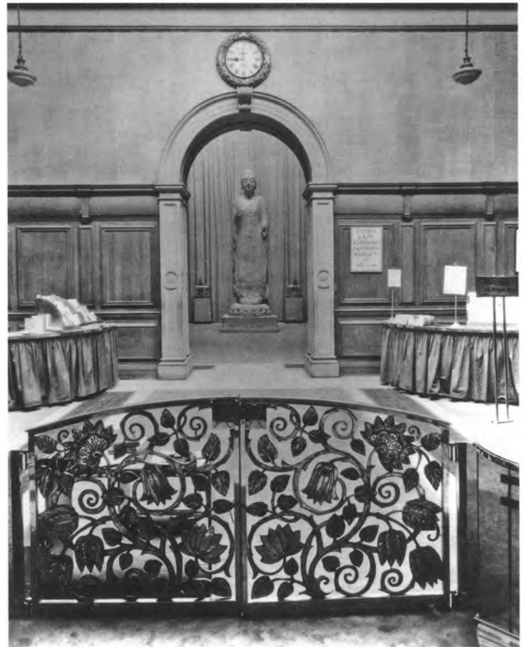
10. Entrance to the exhibition: Vestibule and Central Hall.

Given China's experiences with European and American imperial concessions during the final decades of the Qing dynasty, Sun, Chiang and Mao understood all too well the ramifications of the early twentieth-century encroachment by the Japanese into mainland China. 8 Throughout the nineteenth century England, France and the United States had dominated China militarily, which enabled them to extract