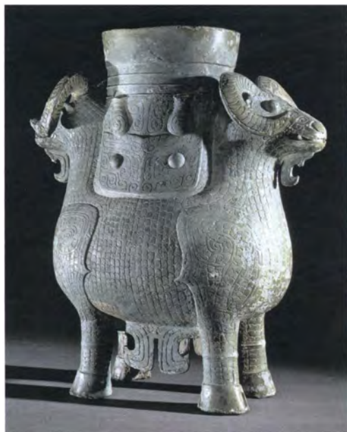
14. Ritual wine vessel in the shape of a pair of rams supporting a jar. Shang dynasty period, thirteenth–twelfth centuries B.C. 43.2 cm. high. (British Museum, London).

In the aftermath of the First World War it had been difficult to secure loans from other European states. Loans from China were even rarer because of its geographical distance and the political revolutions that led to the establishment of the Republic of China in 1911. The 1929 Berlin exhibition included only three works lent from China – from a European collector in Qingdao (Tsingtao), who sent three ceramics dated to the Song dynasty (960–1279). 22 Thus, the extent to which the London organisers aggressively sought works from foreign collections, especially from China and Japan, was a major innovation. To mount such an ambitious exhibition required scholarship, but also business and financial acumen, and the entrée into both private and public collections of Chinese art.