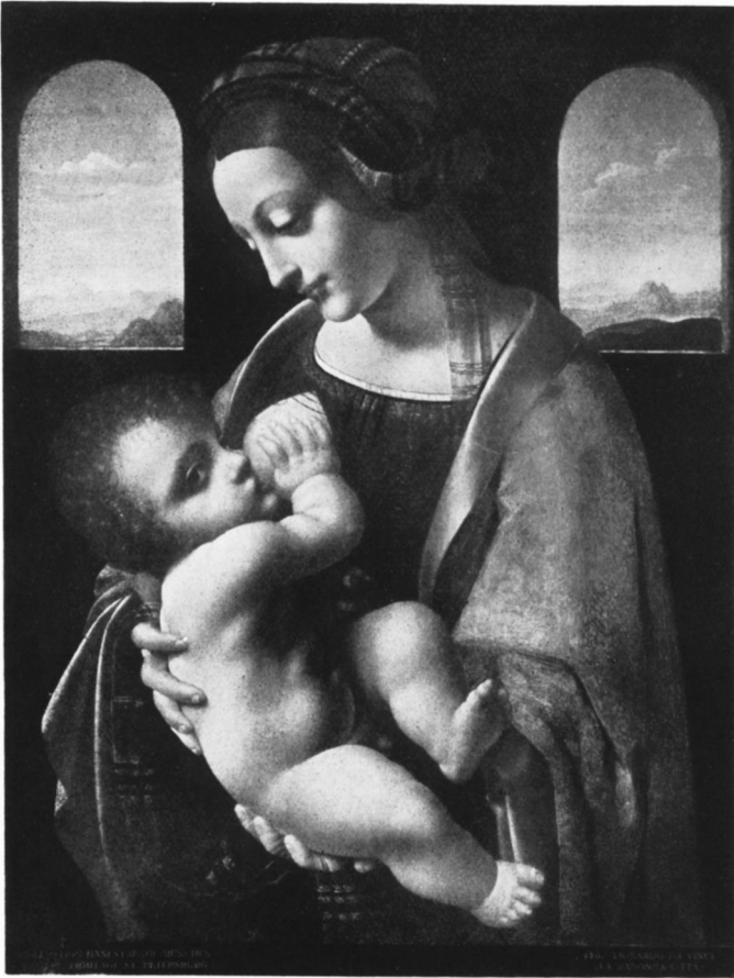
A—The “ Madonna Litta ,” after Leonardo da Vinci. (The Hermitage, Leningrad)