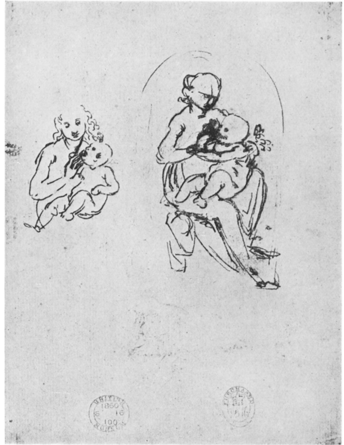
B—Studies for The Virgin and Child, by Leonardo da Vinci