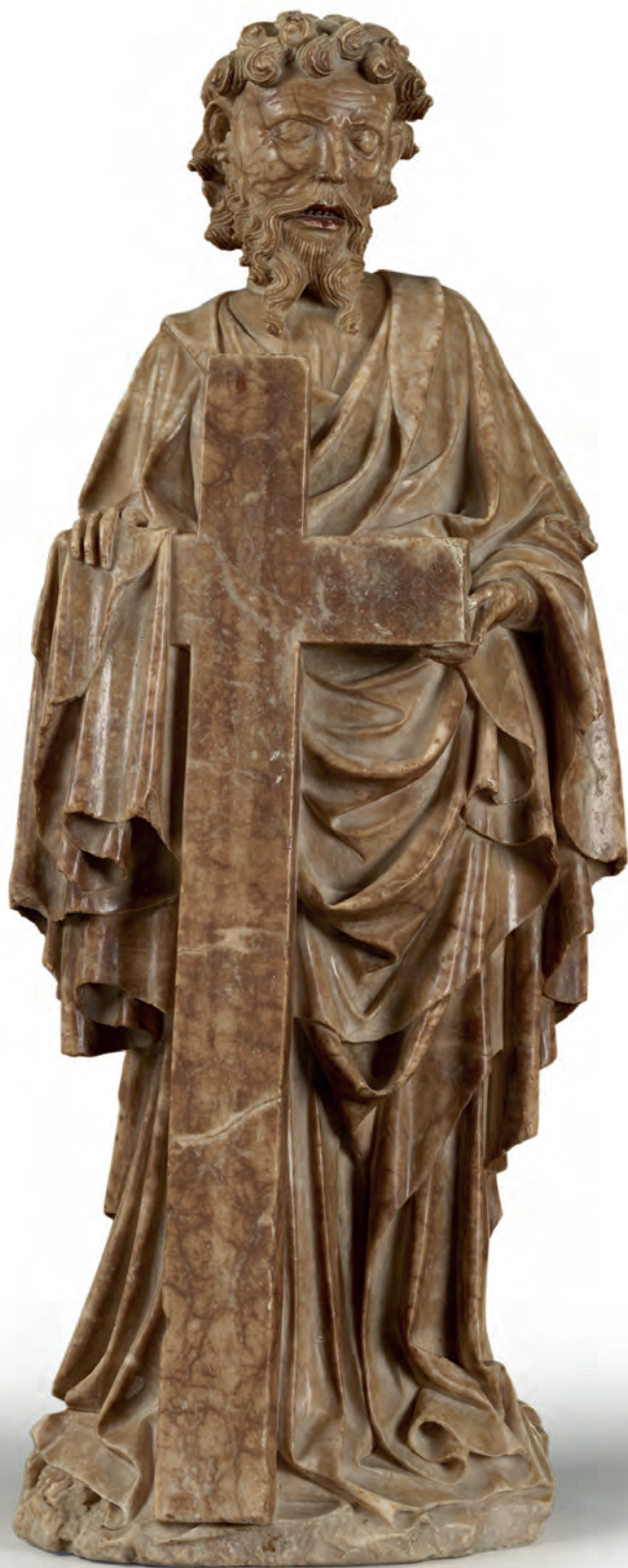
III. St Philip , by the Master of the Rimini Altarpiece (active second quarter fifteenth century). c.1420–30. Alabaster, 43 cm. high. (2015.58).

The statuette represents the apostle Philip holding a cross, a reference to his death by crucifixion. It was probably part of a group of twelve apostles made to decorate an altarpiece in a church or private palace. Traces of pigment are still visible on the lips and eyes, but it is likely that the sculpture was left mostly unpainted to highlight the lively surface of the polished alabaster, with its attractive veining. The Master of the Rimini Altarpiece is recognised as the leading alabaster sculptor of the South Netherlands in the early 1400s. The artist takes his name from an altarpiece that once adorned the Church of S. Maria delle Grazie in Covignano, just outside Rimini, and that is now conserved in the Liebieghaus in Frankfurt.