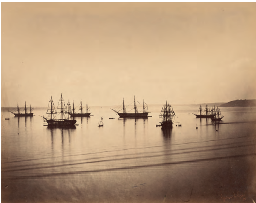
XXI. The French Fleet, Cherbourg , by Gustave Le Gray (1820–84). 4th–6th August 1858. Albumen silver print, 30.8 by 39.1 cm. (2014.57).

Le Gray was a pioneering landscape and portrait photographer best known for his composite seascapes. This photograph depicts the French fleet lying at anchor in the harbor of Cherbourg in Normandy between 4th and 6th August 1858. The occasion was a visit by Emperor Napoleon III and Empress Eugénie to inaugurate the harbour as well as a new railway line linking the town to Paris. The composition is a marvel of geometric simplicity, with the glowing light of the setting sun providing contrast to the stark silhouettes of the ships and gentle waves.