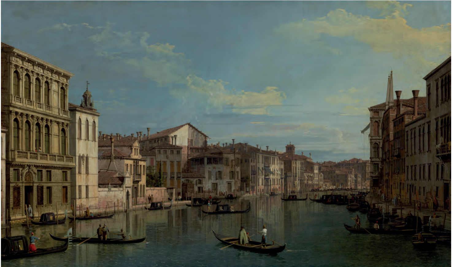
XIV. The Grand Canal in Venice from Palazzo Flangini to Campo San Marcuola , by Canaletto (Giovanni Antonio Canal) (1697–1768). c.1738. Oil on canvas, 47 by 77.8 cm. (2013.22).

Canaletto was at the peak of his powers when he painted this view of the sun-drenched palaces, reflecting in the shimmering water, lining the Grand Canal near the entrance of the Cannaregio Canal. With precise brushwork, he evoked the effects of soot and crumbling stucco disfiguring the façades. The viewer is placed on a boat in the middle of the waterway. A bewigged nobleman stands in the doorway of Palazzo Flangini at left, either about to board or having just alighted from a gondola moored at the steps. A traghetto carrying passengers across the water departs from the embankment at right; another, with a standing passenger in a long greenish cloak, has already reached the middle of the canal.