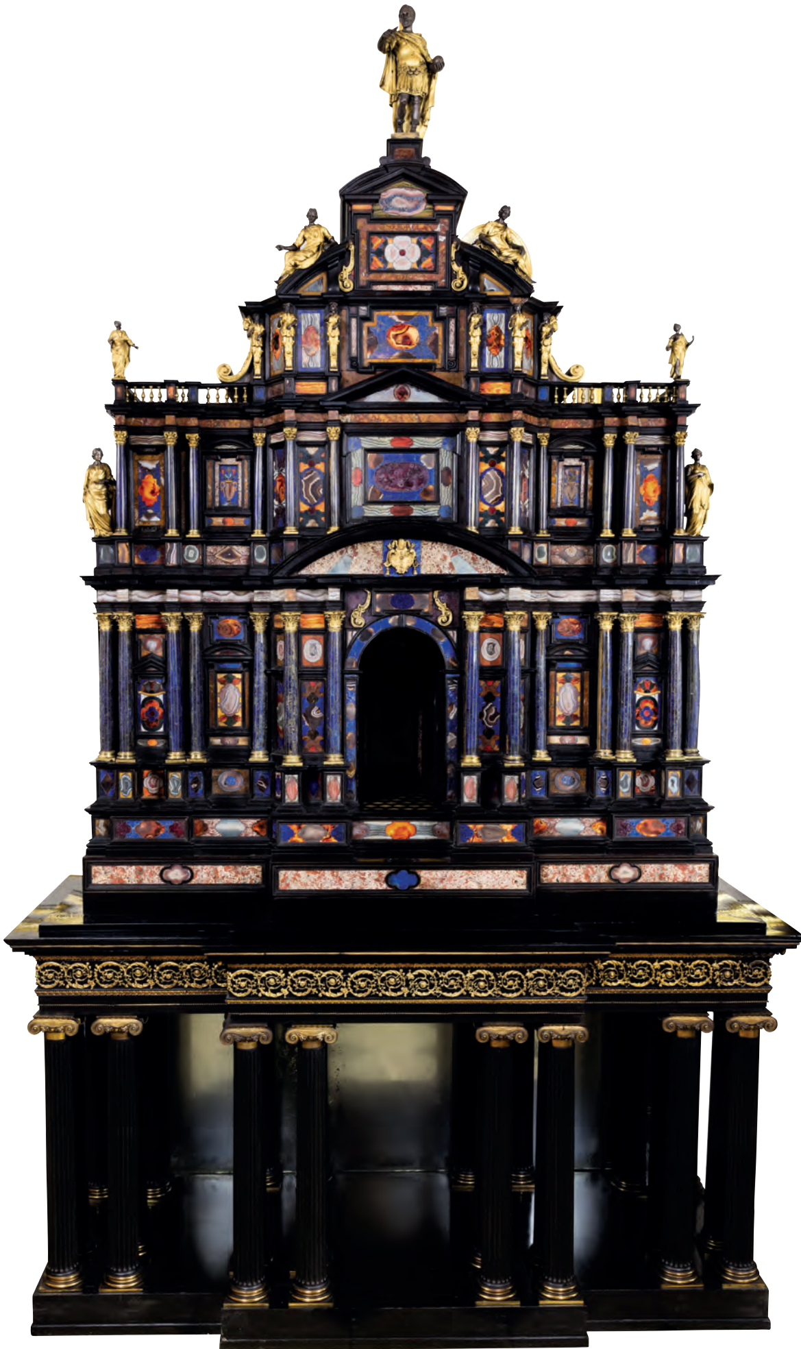
VIII. The Borghese–Windsor Cabinet, made in Rome. c.1620. Ebony, mounted with pietre dure including lapis lazuli, jasper, agate, carnelian and amethyst; and gilded bronze and silver. The stand attributed to Louis François Bellangé (1759–1827), c.1820s, ebony with gilt mounts. Cabinet: 178 by 126 by 54 cm.; stand: 84 by 153.5 by 65.5 cm. (2016.66).

The design of this ornate display cabinet, one of the most impressive pieces of pietre dure furniture produced in Rome in the early seventeenth century, suggests the façade of a church. Brilliantly coloured and technically superb, it was made for Pope Paul V Borghese, whose coat of arms adorns the central pediment. In the early 1820s it was acquired from Prince Camillo Borghese by the London dealer Edward Holmes Baldock, who probably commissioned the Neo-classical stand on which it still rests. Baldock sold the cabinet and stand to King George IV in 1827. It remained in the Royal collection, displayed at Windsor Castle, Buckingham Palace, and Marlborough House, until 1959, when it was sold at auction to the father of businessman Robert de Balkany, who kept it in his Hôtel Feuquières at rue de Varenne in Paris.