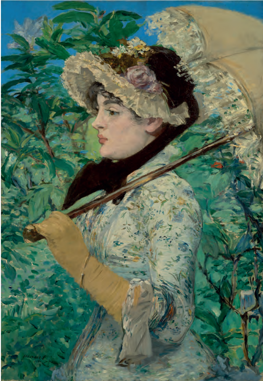
XVIII. Jeanne (Spring) , by Edouard Manet (1832–83). 1881. Oil on canvas, 74 by 51.5 cm. (2014.62).