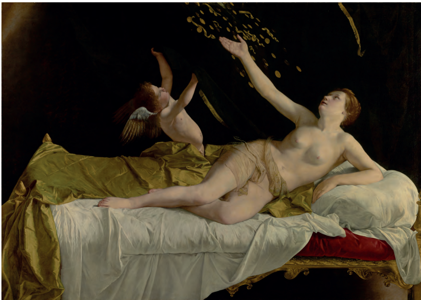
IX. Danaë and the Shower of Gold , by Orazio Gentileschi (1563–1639). 1621–23. Oil on canvas, 161.3 by 226.7 cm. (2016.6).