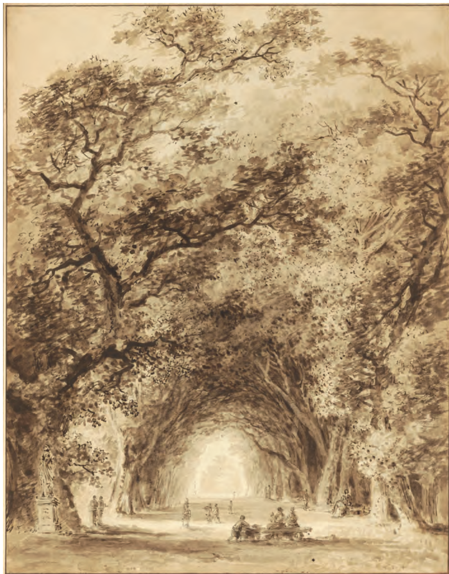
XI. A Shaded Avenue , by Jean Honoré Fragonard (1732–1806). c.1774. Pen and brown ink, brush with brown wash, over black chalk on paper, 44.5 by 34.4 cm. (2016.77).

This large and unusually well-preserved drawing is one of Fragonard's most accomplished graphic conceptions. A plunging perspective focuses on a small patch of brilliant sunlight at the end of a majestic avenue of trees, the scene an essay on the abstract qualities of light. The location has been tentatively identified as the park at the Château de Nointel near Paris or that at the Château de Nègrepelisse in the south of France. Both properties belonged to Fragonard's patron Bergeret de Grancourt, with whom the artist had just completed a trip to Italy. The Italianate elements have also spurred suggestions that the location could be the Villa Mattei in Rome. Nevertheless, the composition is largely the product of Fragonard's vibrant imagination.